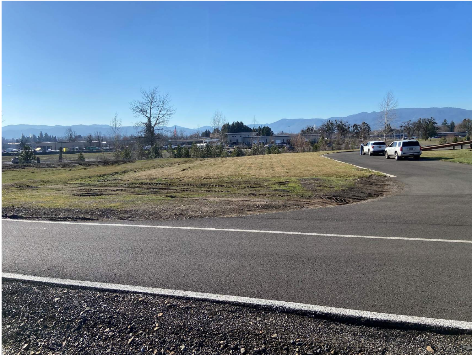
North of new fueling system site looking southwest.