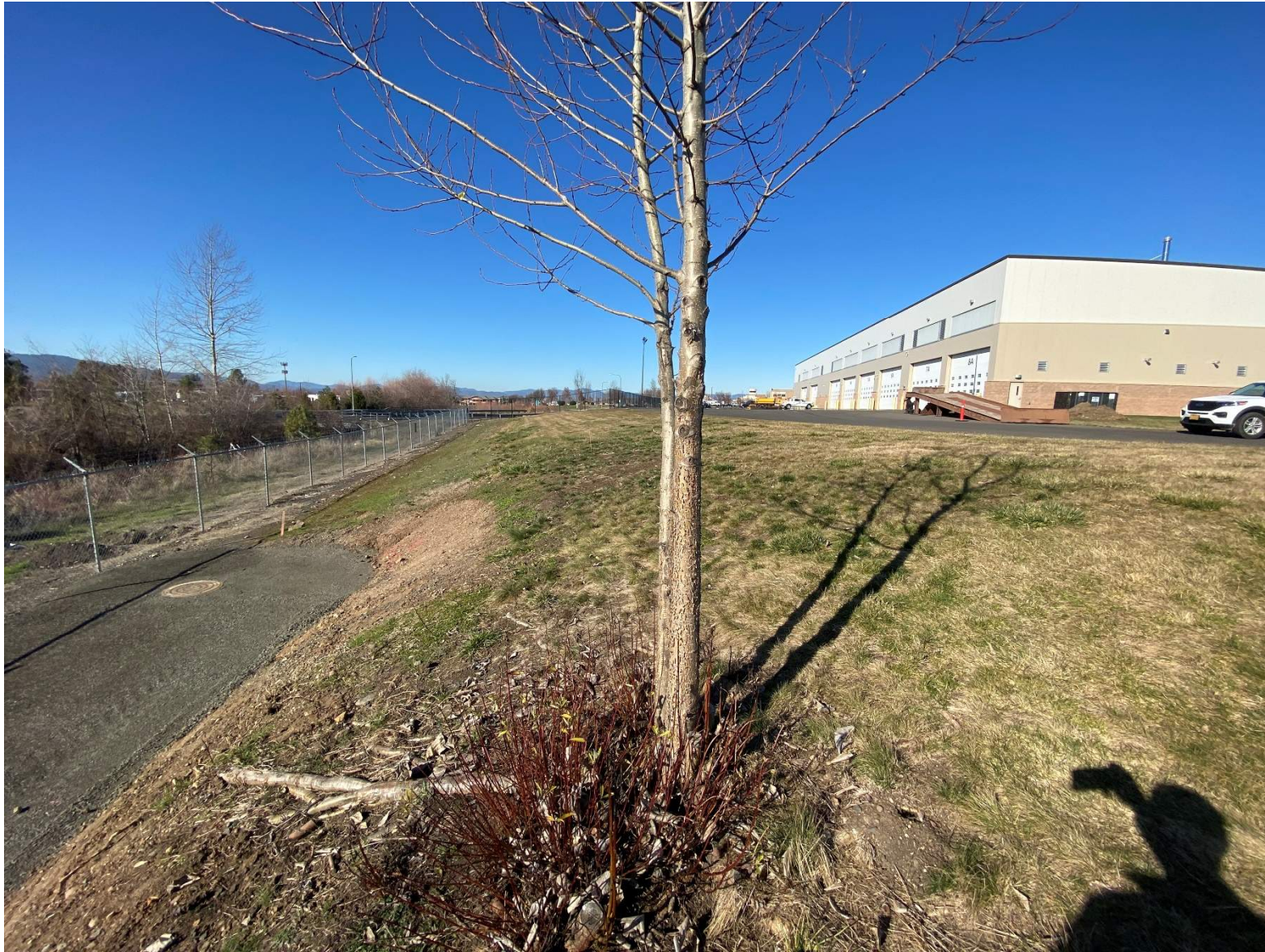
South end of new fueling system looking northwest.