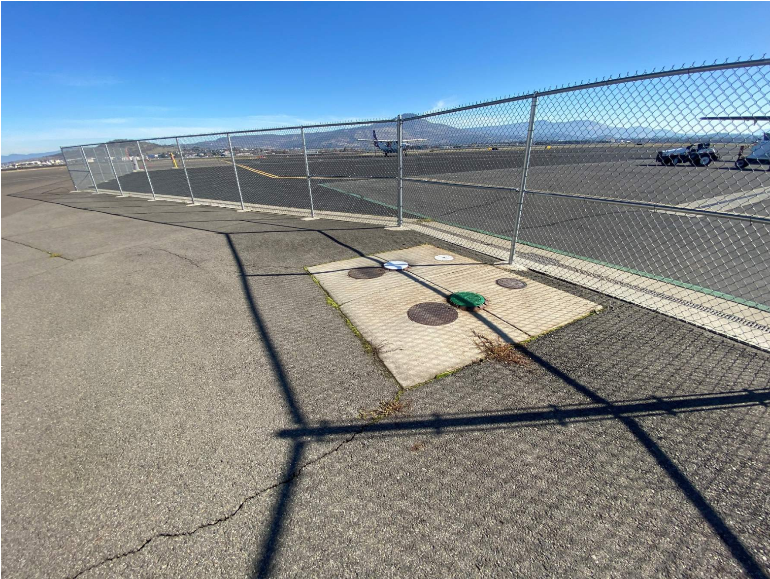
Existing fueling system tank pad.