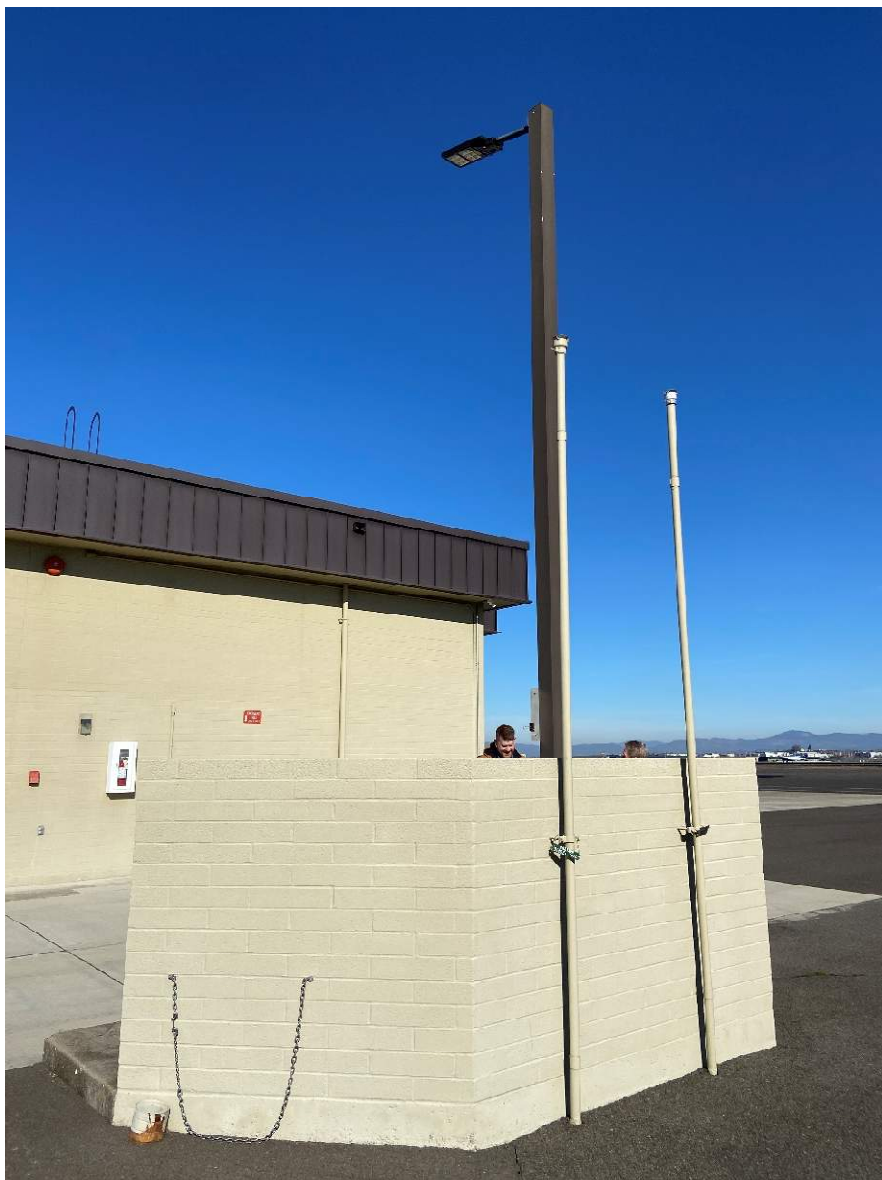
Existing fueling system island.