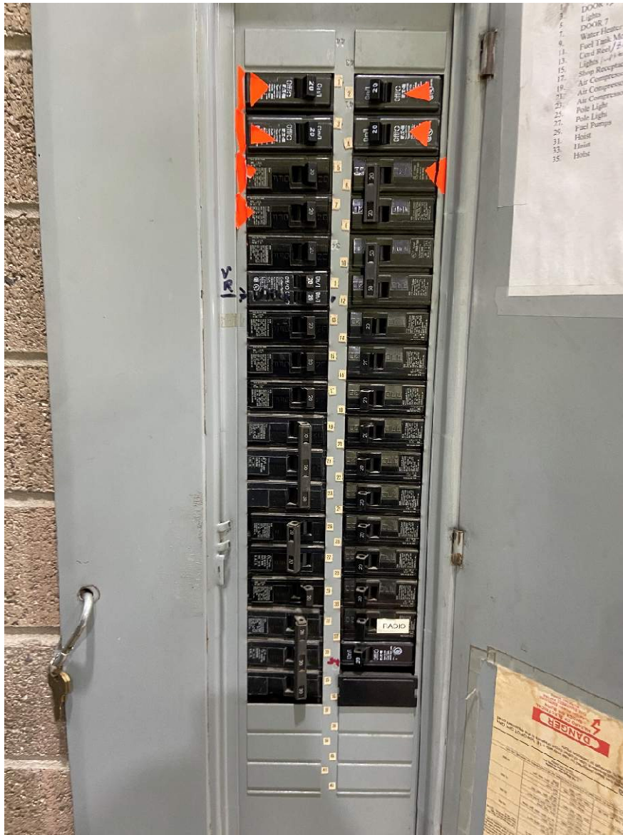
Electrical panel in ARFF building that houses existing fuel system circuit breakers.