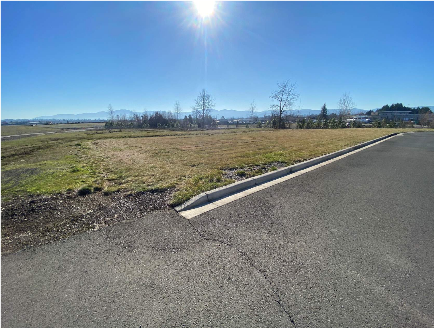
North of new fueling system site looking south.