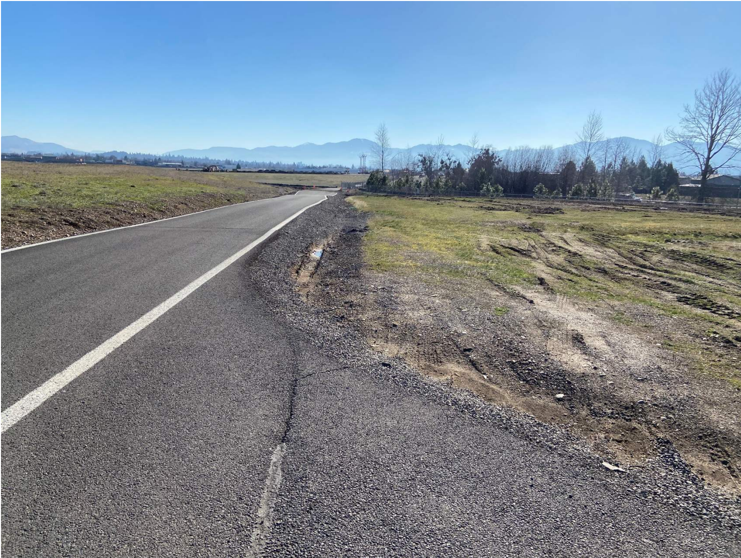
North end of new fueling system site looking southeast.