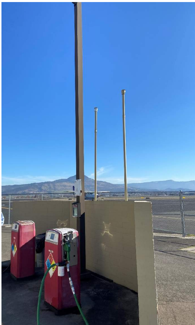
Existing fueling system dispensers and appurtenances.