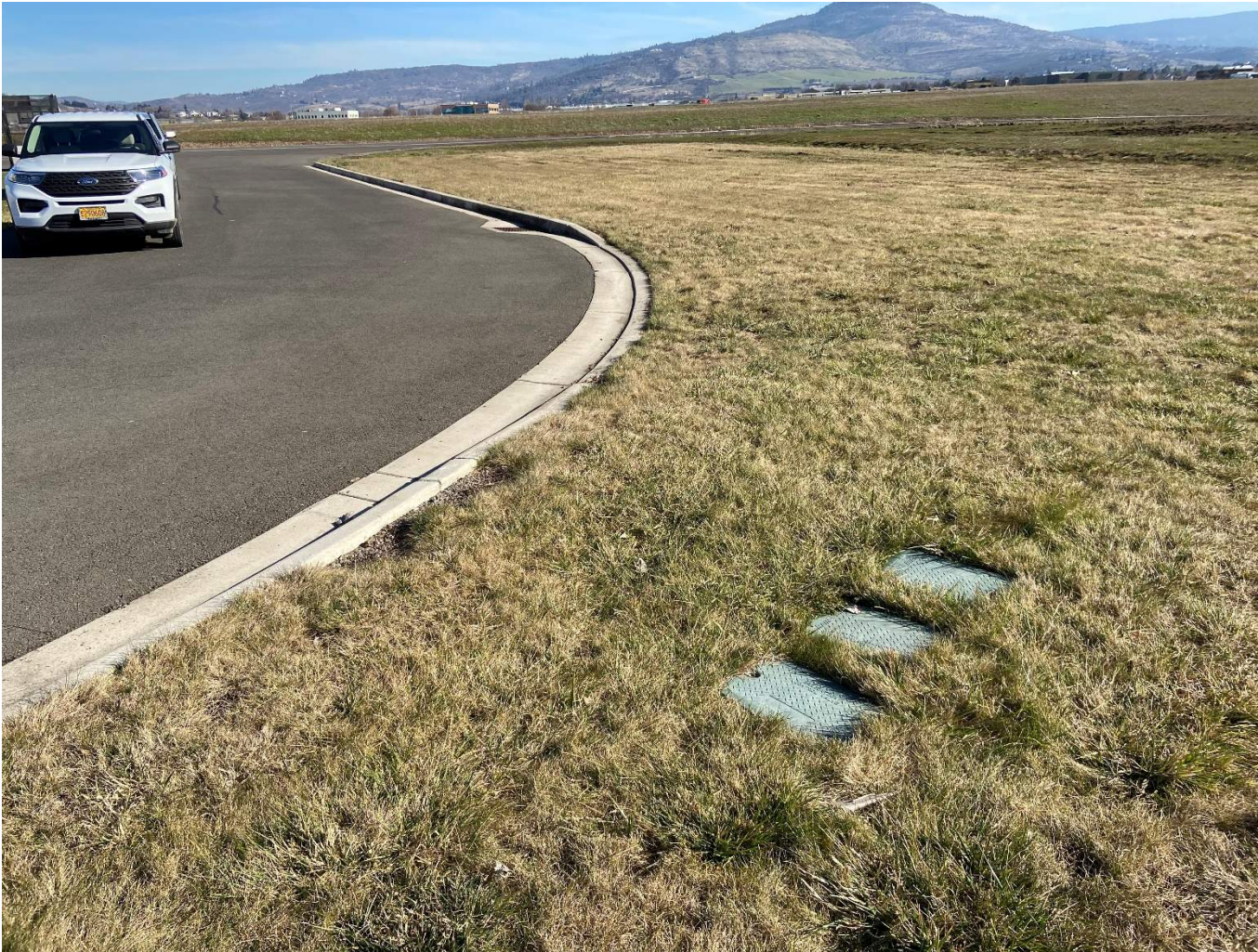
West portion of new fueling system site looking east.