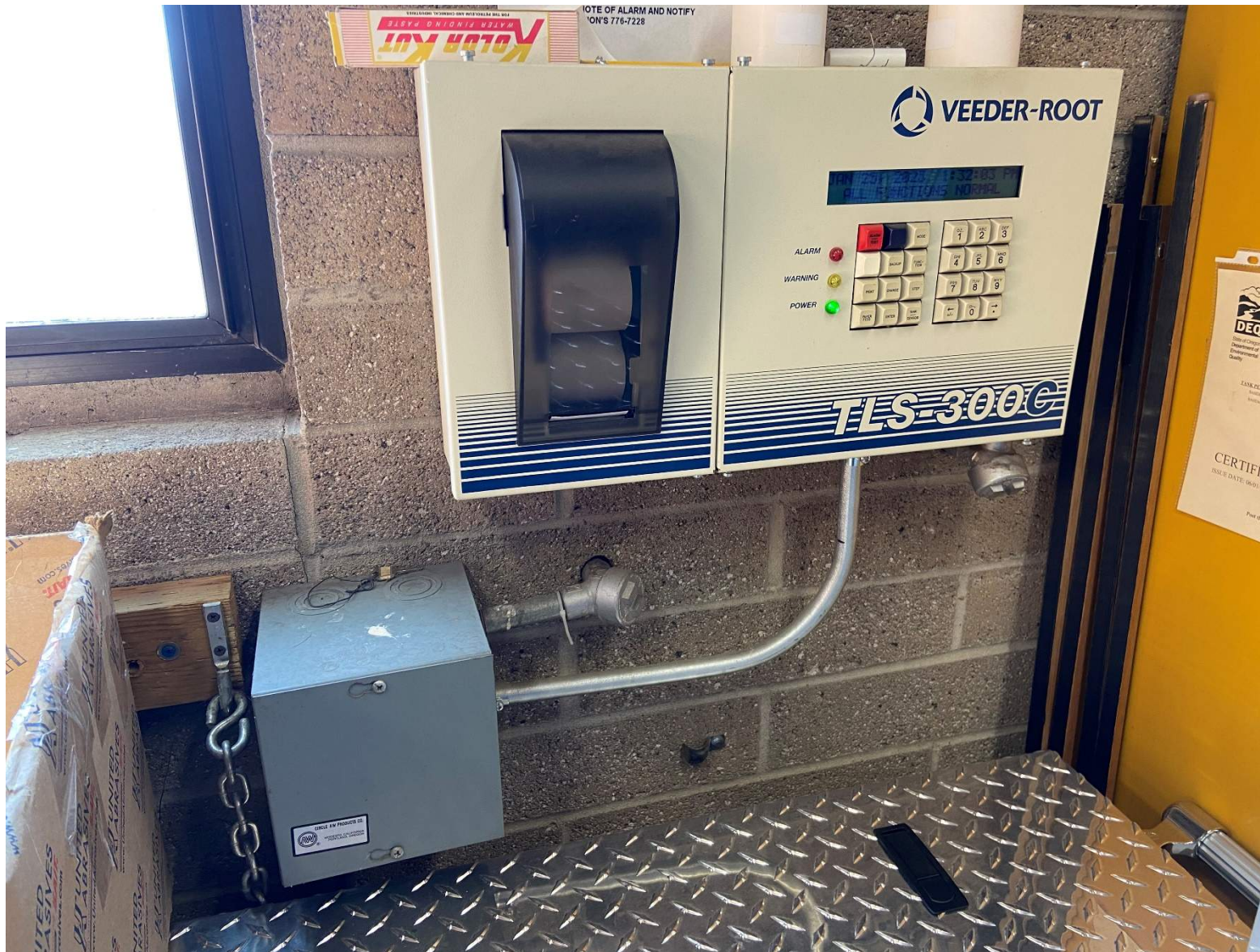
Existing fuel system tank monitoring system.