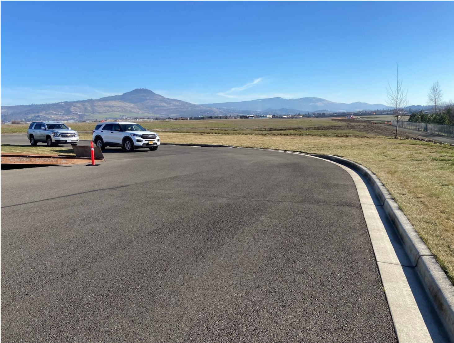
Northwest of new fueling system looking southeast.