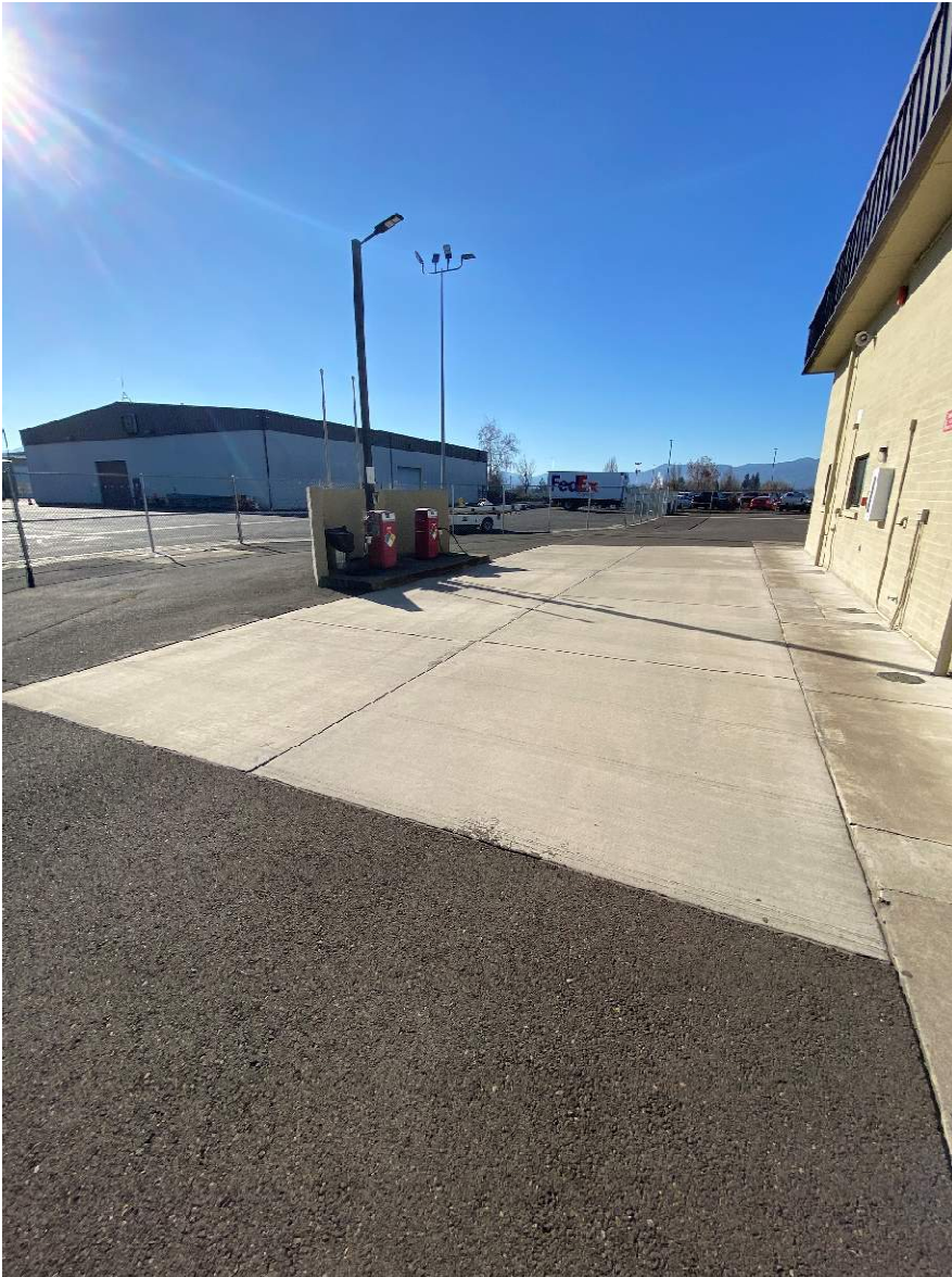
Northeast of existing fueling system looking southwest.